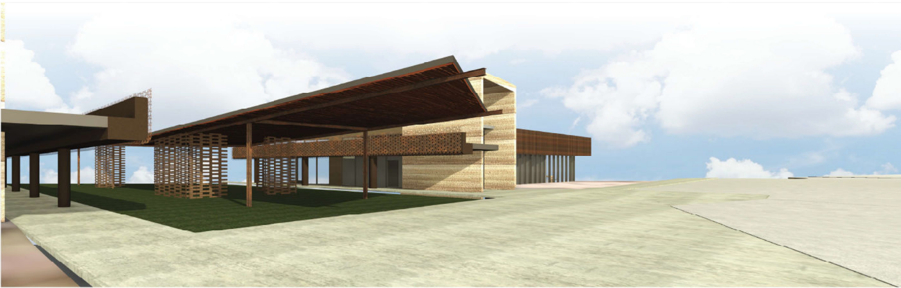
① 3D View 10