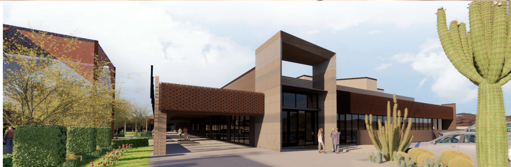
② CAMERA SHOT - SOUTHWEST CORNER SANC REV 5 CAVE