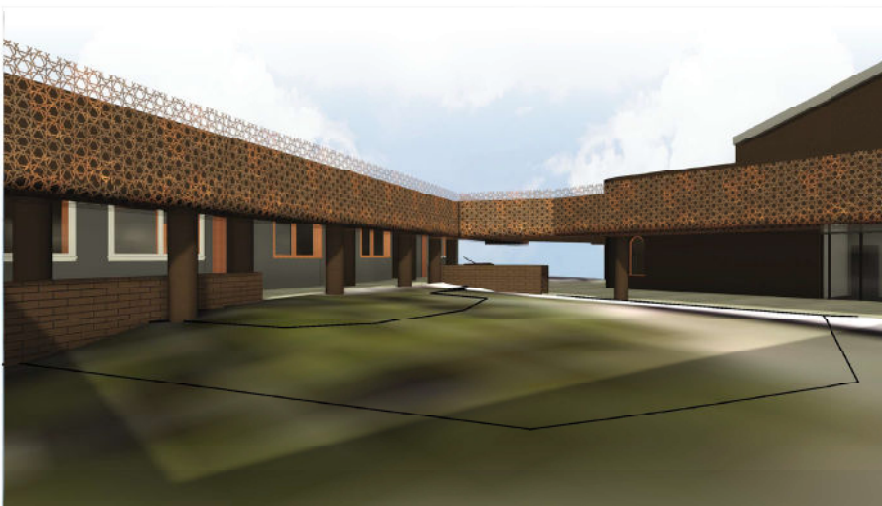
③ 3D View 12