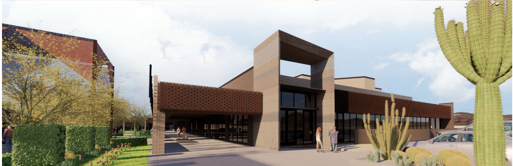
② CAMERA SHOT - SOUTHWEST CORNER SANC REV 5 CAVE