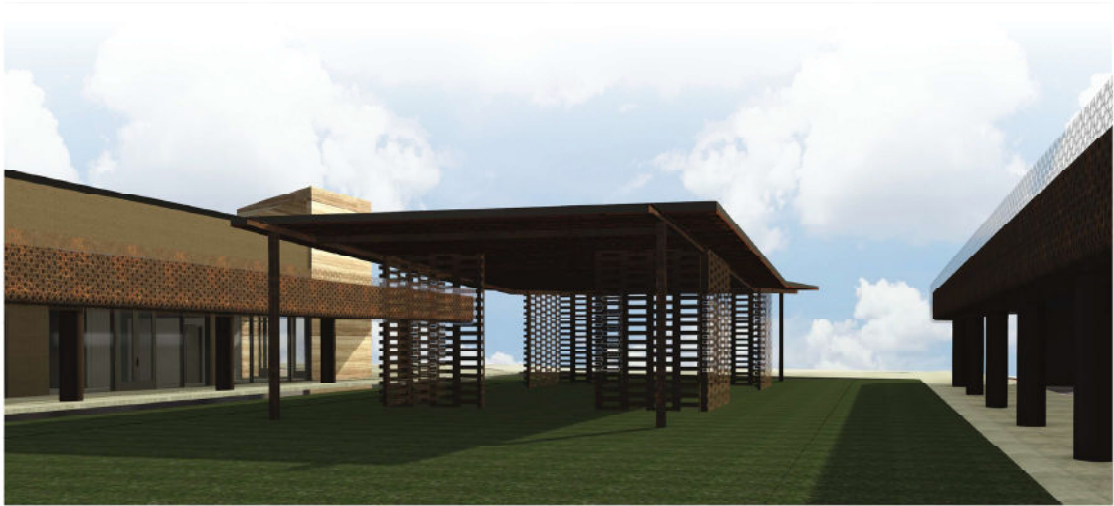
② 3D View 11