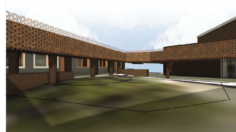
③ 3D View 12